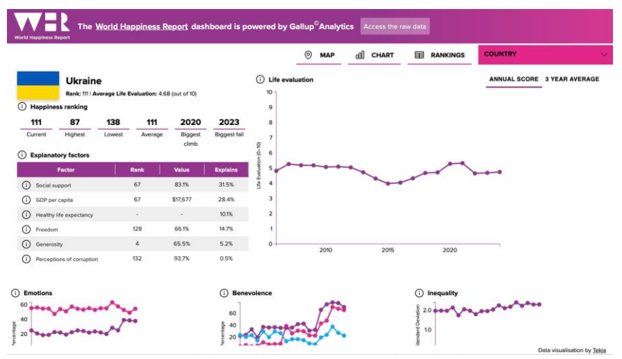
Figure 1. World Happiness Report Data for Ukraine, 2024

interpreted as an indication of resilience and the presence of internal sources of meaning that sustain individuals even under conditions of objective hardship.